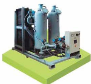
Equipment for filtering or purifying gases – cleaning gases from vaporous and gaseous impurities