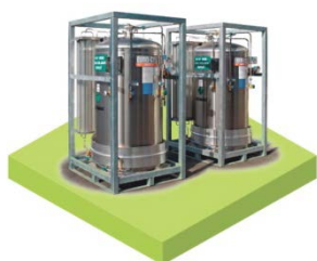
Gasifier – device for biomass gasification