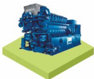
Co-generator – equipment for electric and heat power producing by biogas burning